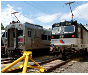
New Jersey Transit