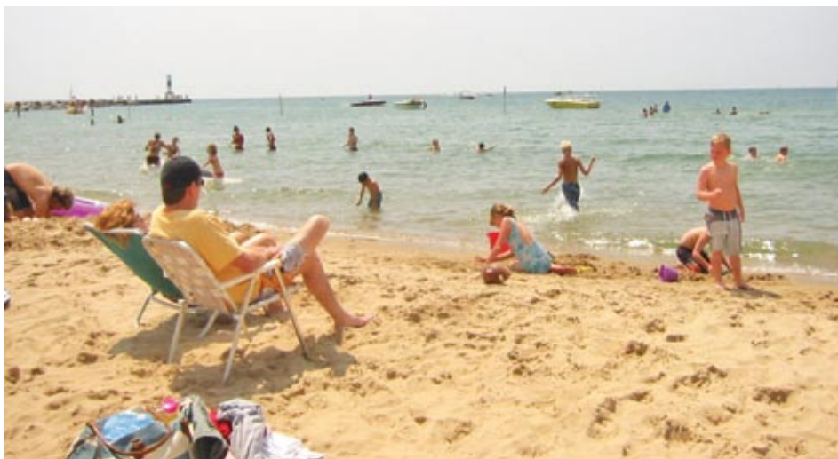
Lake Michigan beaches draw thousands to enjoy the sun and water.