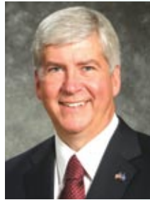
Gov. Rick Snyder