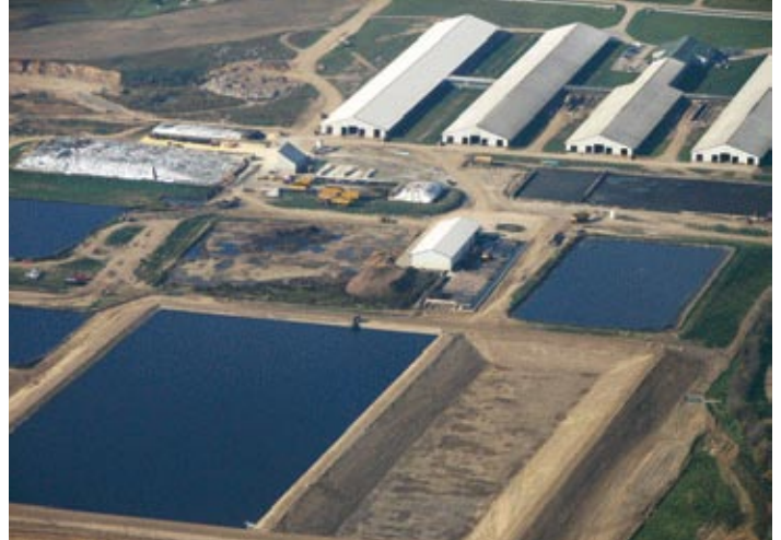
Large factory farms can produce as much animal waste as a medium-sized city.

◆ On climate change: "Clearly the science supports" the theory that manmade greenhouse gas emissions contribute to changing the climate, "and clearly the goal should be reducing emissions" as well as "mitigation and adaptation."