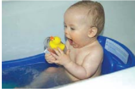
Families would get information about toxic chemicals in children's toys under the legislation being drafted.