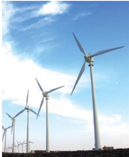
Electricity from wind turbines is already less expensive than it would be from a new coal plant, according to the state's Public Service Commission.

In a separate rate filing in late February, Consumers Energy reported that meeting the renewable energy law's