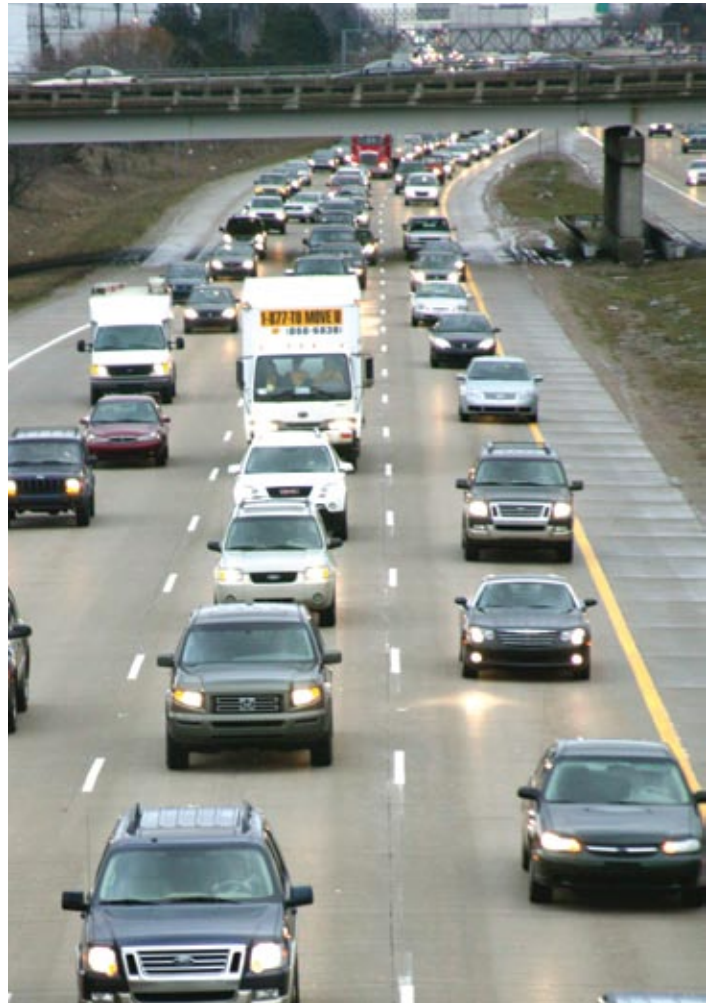
Michigan spent 81 percent of its Recovery Act transportation money to maintain existing roadways. The remaining 19 percent went toward new roads or other capacity.

In spending on public transportation, Michigan ranked 38 th —using only 2.6 percent of the federal funds on such projects. Each of the other seven Great Lakes states spent a higher percentage on public transportation—led by New York at 21.2 percent.