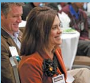
State Sen. Minority Leader Gretchen Whitmer, D-East Lansing