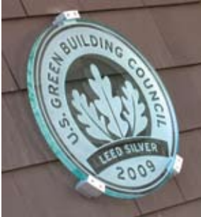
The Crystal Mountain Spa is the Midwest's only LEED-certified spa.

How Crystal Mountain is pioneering sustainability in the resort industry